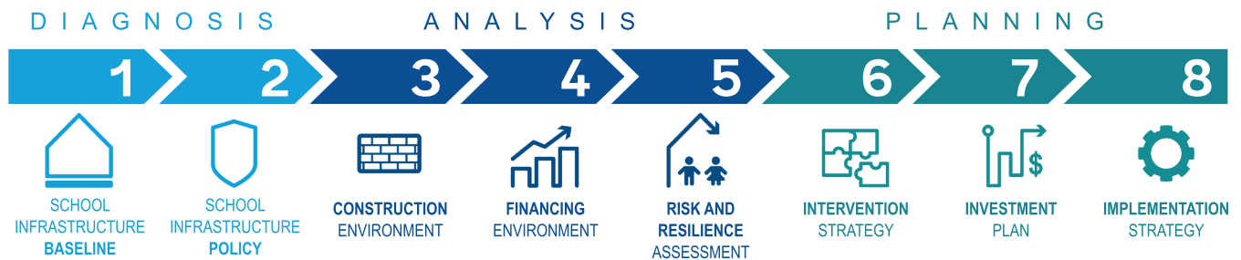
Figure 1. Structure of the RSRS

The roadmap consists of eight steps that follow a logical sequence from diagnosis to analysis to planning at scale.